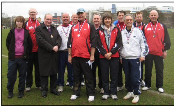
Birmingham Transplant Games Team

On a very wet and cold Saturday afternoon patients and staff turned out to play Rounders. It was hoped the weather would have been better but a very enjoyable afternoon was had by all.