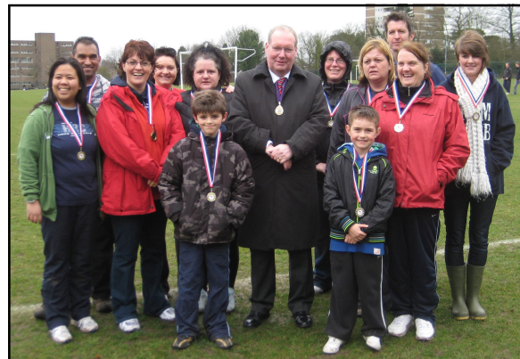
Renal Unit Team