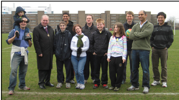
Liver Unit Team

Each team played each other and the winning team at the end of the afternoon was the Renal Team. Very well done. Everyone enjoyed themselves and decided that they would take up the challenge again next year, but at a warmer time if possible. The event raised £285 which will go to the three charities, The Liver Unit, Queen Elizabeth Hospital Kidney Patients' Association and the Birmingham Transplant Games Team.